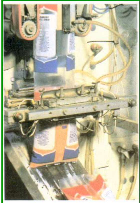
Used on the heated jaws of packaging machine to prevent sticky residue causing problems on bag sealing operation.

Plain & adhesive backed PTFE coated glass cloth..